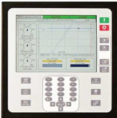
MAESTRO Universal Centrifugal Compressor