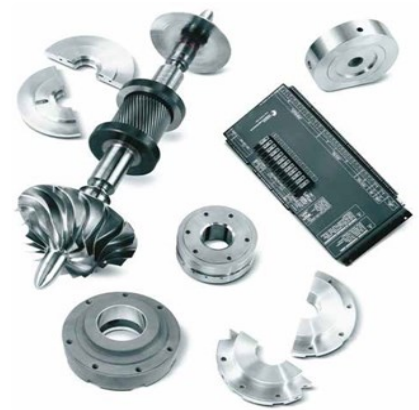
MSG® Centrifugal Compressor Replacement Parts