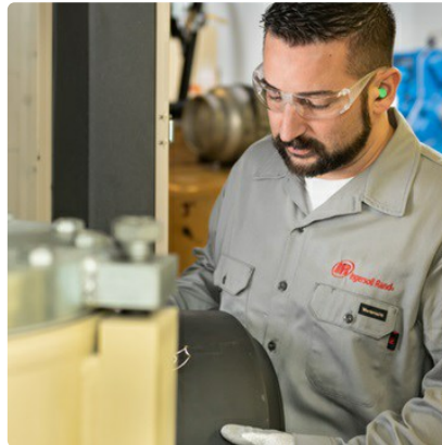
Field Overhaul Services