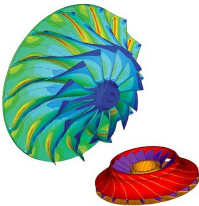
Upgrade - Aerodynamic Enhancements for