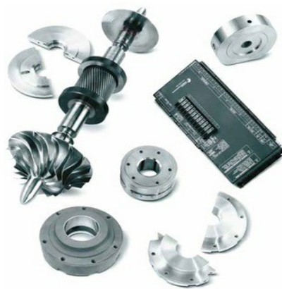
MSG® TURBO-AIR® Centrifugal Compressor